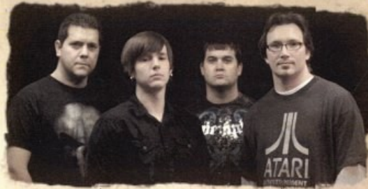
70 TIMES 7