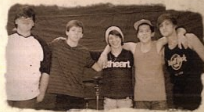
SEE ME, THE BROKEN